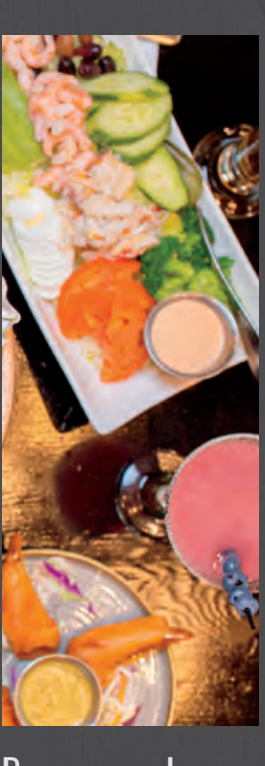
r u n c h i n n e r

Scott's Seafood has been a South Bay tradition for over 30 years, with an emphasis on sustainable, healthy food options.