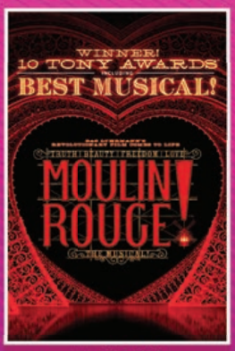
JUL 8-20, 2025