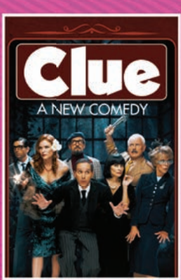
OCT 29-NOV 3, 2024