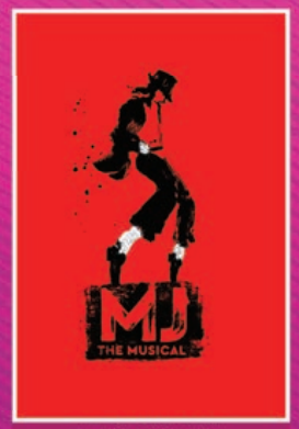
JUL 29-AUG 3, 2025